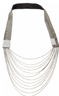
Style name: Gui Necklace Style no: 0916-44

Quality: 60% iron, 10% glass, 30% cotton Type: Accessories Size: OneSize Color: 000 Black Deliveries: Dec/Jan + 15 days, Feb/Mar + 15 days