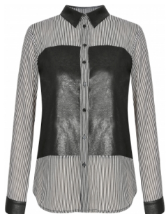
Style name: Ghena Shirt Style no: 6710-40

Quality: 50% viscose, 50% polyester Type: Shirts Size: XS - XXL Color: 000 Black mix Deliveries: Dec/Jan + 15 days