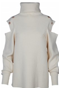
Style name: Git Blouse knit Style no: 6759-52

Quality: 55% acrylic, 28% polyester, 17% nylon Type: Blouses Size: XS - XXL Color: 111 vanilla Deliveries: Dec/Jan + 15 days