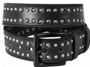
Style name: Gowri Belt Style no: 0912-75

Type: Accessories Size: XS/S - XL/XXL Color: 000 Black Deliveries: Dec/Jan + 15 days, Feb/Mar + 15 days