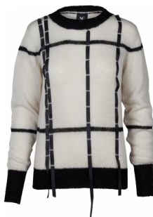
Style name: Gisela Blouse knit Style no: 6758-50

Quality: 32% mohair, 28% wool, 40% nylon Type: Blouses Size: XS - XXL Color: 111 vanilla mix Deliveries: Dec/Jan + 15 days