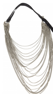
Style name: Gui Necklace Style no: 0916-25

Quality: 70% iron, 30% leather Type: Accessories Size: OneSize Color: 000 Black Deliveries: Dec/Jan + 15 days, Feb/Mar + 15 days