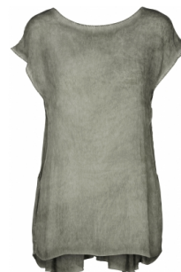
Style name: Gunni Top Style no: 6775-55

Quality: 70% viscose, 30% silk Type: Tops and T-shirts Size: XS - XXL Color: 343 Dust army Deliveries: Feb/Mar + 15 days