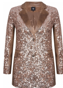
Style name: Glorie Blazer Style no: 6766-35

Quality: 100 % Polyester Type: Jackets Size: XS - XXL Color: 220 Camel Deliveries: Feb/Mar + 15 days