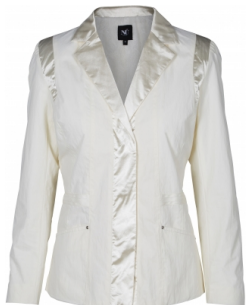
Style name: Ginny Jacket Style no: 6764-35

Quality: 70% cotton, 30% nylon Type: Jackets Size: XS - XXL Color: 111 vanilla Deliveries: Feb/Mar + 15 days