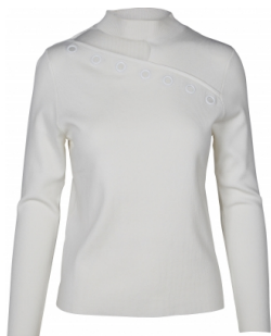
Style name: Goda Blouse knit Style no: 6761-52

Quality: 80% viscose, 20% nylon Type: Blouses Size: XS - XXL Color: 110 Creme Deliveries: Dec/Jan + 15 days