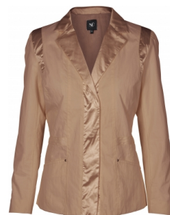
Style name: Ginny Jacket Style no: 6764-35

Quality: 70% cotton, 30% nylon Type: Jackets Size: XS - XXL Color: 220 Camel Deliveries: Feb/Mar + 15 days