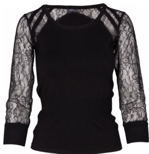
Style name: Glady Blouse knit Style no: 6763-50

Quality: 80% viscose, 20% nylon Type: Blouses Size: XS - XXL Color: 000 Deliveries: Feb/Mar + 15 days