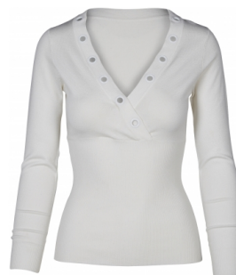
Style name: Goda Blouse knit Style no: 6761-50

Quality: 80% viscose, 20% nylon Type: Blouses Size: XS - XXL Color: 110 Creme Deliveries: Dec/Jan + 15 days