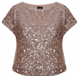
Style name: Glorie Top Style no: 6766-40

Quality: 100% polyester. Bi fabric 100% viscose Type: Tops and T-shirts Size: XS - XXL Color: 220 Camel Deliveries: Feb/Mar + 15 days