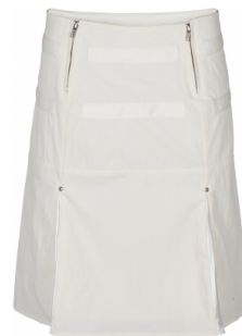
Style name: Ginny Skirt Style no: 6764-20

Quality: 70% cotton, 30% nylon Type: Skirts Size: 34 - 46 Color: 111 vanilla Deliveries: Feb/Mar + 15 days