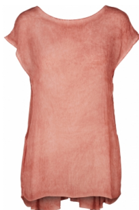
Style name: Gunni Top Style no: 6775-55

Quality: 70% viscose, 30% silk Type: Tops and T-shirts Size: XS - XXL Color: 679 paprika Deliveries: Feb/Mar + 15 days