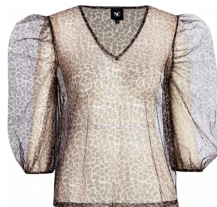
Style name: Groa Blouse Style no: 6778-42

Quality: 100% polyester Type: Blouses Size: XS - XXL Color: 000 Black mix Deliveries: Feb/Mar + 15 days