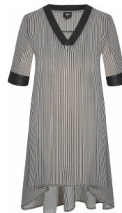
Style name: Ghena Tunic Style no: 6710-26

Quality: 50% viscose, 50% polyester Type: Blouses Size: XS - XXL Color: 000 Black mix Deliveries: Dec/Jan + 15 days