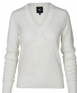
Style name: Glenn Blouse knit V-neck Style no: 6762-50

Quality: 75% polyester, 10% nylon, 10% acrylic, 5% wool Type: Blouses Size: XS - XXL Color: 110 Creme Deliveries: Feb/Mar + 15 days