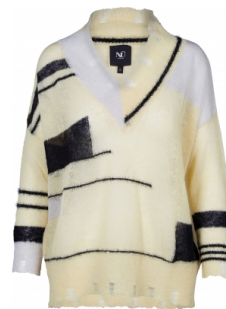
Style name: Gisela Blouse knit Style no: 6758-52

Quality: 32% mohair, 28% wool, 40% nylon Type: Blouses Size: XS - XXL Color: 528 Mineral Yellow mix Deliveries: Dec/Jan + 15 days