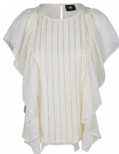
Style name: Guri Top Style no: 6776-45

Quality: 95% polyester, 5% elastane Type: Tops and T-shirts Size: XS - XXL Color: 111 vanilla Deliveries: Feb/Mar + 15 days