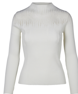
Style name: Glenn Blouse knit Style no: 6762-52

Quality: 65% polyester, 20% nylon, 10% acrylic, 5% wool Type: Blouses Size: XS - XXL Color: 110 Creme Deliveries: Feb/Mar + 15 days