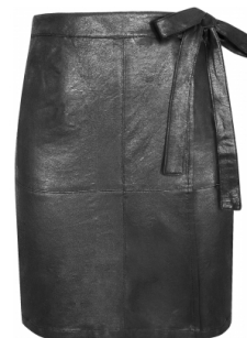
Style name: Gia Skirt Style no: 6711-20

Quality: 50% polyamide, 40% polyester, 10% elasthan Type: Skirts Size: 34 - 46 Color: 000 Black Deliveries: Feb/Mar + 15 days