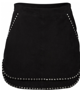
Style name: Ginni Skirt Style no: 6781-20

Quality: 100% leather Type: Skirts Size: 34 - 46 Color: 000 Black Deliveries: Feb/Mar + 15 days