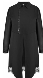
Style name: Grit Tunic Style no: 6767-26

Quality: 100 % Polyester Type: Blouses Size: XS - XXL Color: 000 Black Deliveries: Dec/Jan + 15 days