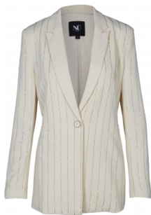
Style name: Guri Blazer Style no: 6776-35

Quality: 95% polyester, 5% elastane Type: Jackets Size: XS - XXL Color: 111 vanilla Deliveries: Feb/Mar + 15 days