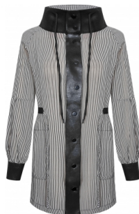
Style name: Ghena Shirt long Style no: 6710-42

Quality: 50% viscose, 50% polyester Type: Shirts Size: XS - XXL Color: 000 Black mix Deliveries: Dec/Jan + 15 days