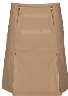
Style name: Ginny Skirt Style no: 6764-20

Quality: 70% cotton, 30% nylon Type: Skirts Size: 34 - 46 Color: 220 Camel Deliveries: Feb/Mar + 15 days