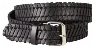
Style name: Gowri Belt Style no: 0912-76

Type: Accessories Size: XS/S - XL/XXL Color: 000 Black Deliveries: Dec/Jan + 15 days, Feb/Mar + 15 days