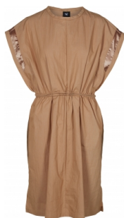
Style name: Ginny Dress Style no: 6764-23

Quality: 70% cotton, 30% nylon Type: Dresses Size: XS - XXL Color: 220 Camel Deliveries: Feb/Mar + 15 days