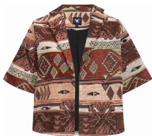
Style name: Goldi Jacket Style no: 6777-35

Quality: 100% polyester. Bi fabric 100% viscose Type: Jackets Size: XS - XXL Color: 220 Camel mix Deliveries: Feb/Mar + 15 days