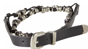
Style name: Gui Necklace Style no: 0916-77

Quality: 50% leather 50% iron Type: Accessories Size: OneSize Color: 000 Black Deliveries: Dec/Jan + 15 days, Feb/Mar + 15 days