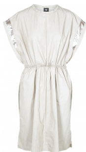
Style name: Ginny Dress Style no: 6764-23

Quality: 70% cotton, 30% nylon Type: Dresses Size: XS - XXL Color: 111 vanilla Deliveries: Feb/Mar + 15 days