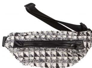
Style name: Genta Bag Style no: 6708-85

Quality: 100 % Polyester Type: Accessories Size: OneSize Color: 000 Black mix Deliveries: Dec/Jan + 15 days