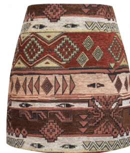
Style name: Goldi Skirt Style no: 6777-20

Quality: 100% polyester Type: Skirts Size: 34 - 46 Color: 220 Camel mix Deliveries: Feb/Mar + 15 days