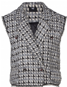
Style name: Genta Waistcoat Style no: 6708-33

Quality: 100 % Polyester Type: Jackets Size: XS - XXL Color: 000 Black mix Deliveries: Dec/Jan + 15 days