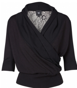
Style name: Glady Blouse knit Style no: 6763-52

Quality: 80% viscose, 20% nylon Type: Blouses Size: XS - XXL Color: 000 Deliveries: Feb/Mar + 15 days