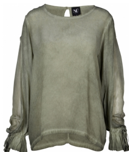
Style name: Gunni Blouse Style no: 6775-50

Quality: 70% viscose, 30% silk Type: Blouses Size: XS - XXL Color: 343 Dust army Deliveries: Feb/Mar + 15 days