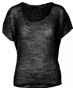
Style name: Greta Blouse s/s knit Style no: 6749-61

Quality: 100% wool Type: Blouses Size: XS - XXL Color: 000 Black Deliveries: Feb/Mar + 15 days