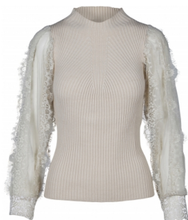
Style name: Git Blouse knit Style no: 6759-50

Quality: 50% viscose, 28% polyester, 22% nylon Type: Blouses Size: XS - XXL Color: 111 vanilla Deliveries: Dec/Jan + 15 days