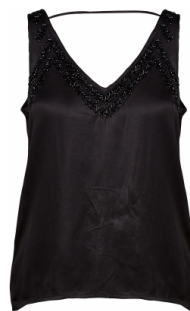
Style name: Gee Top Style no: 6782-46

Quality: 100% viscose Type: Tops and T-shirts Size: XS - XXL Color: 000 Black Deliveries: Feb/Mar + 15 days